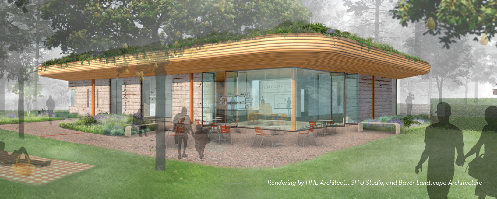
Rendering by HHL Architects, SITU Studio, and Bayer Landscape Architecture