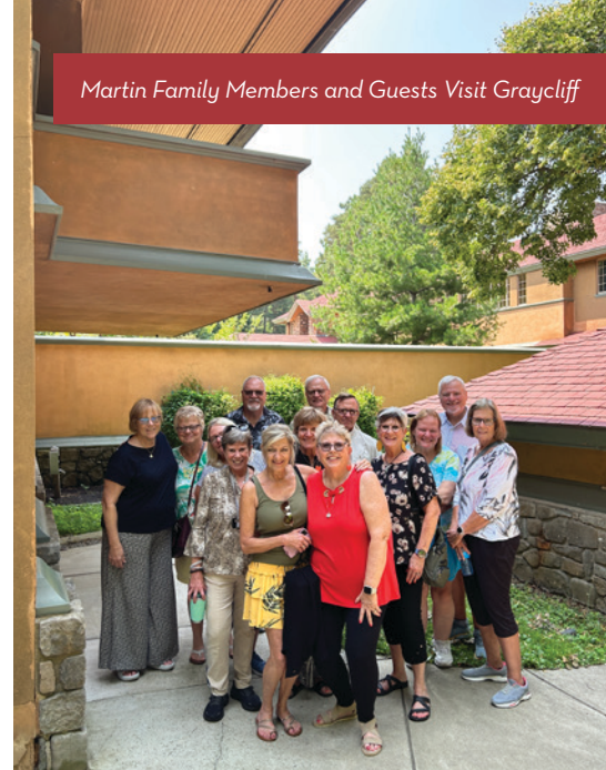
Martin Family Members and Guests Visit Graycliff