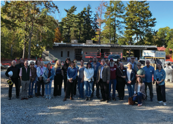
Hard hat tour